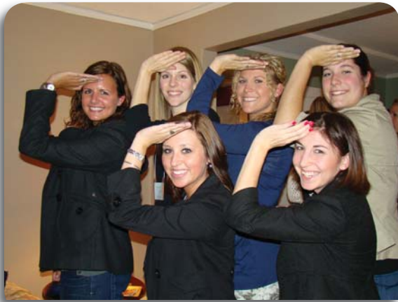
Sisters do the DG salute at a Portland Suburban alumnae chapter event.