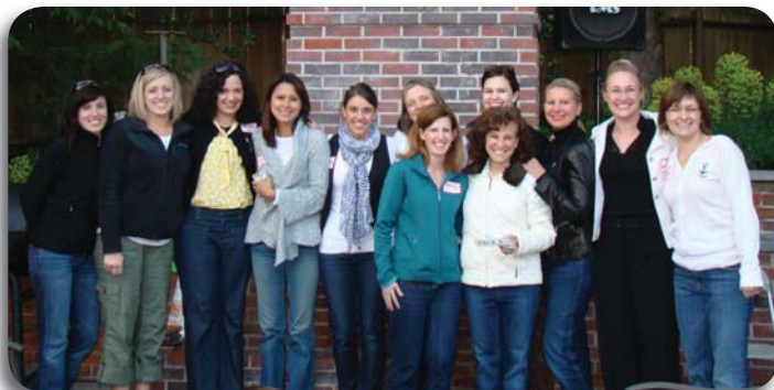
Your 2011-2012 officers at your service!